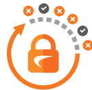
Secure Access Service Edge