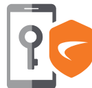
Secure Remote Access