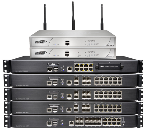
Network Security Appliance Series